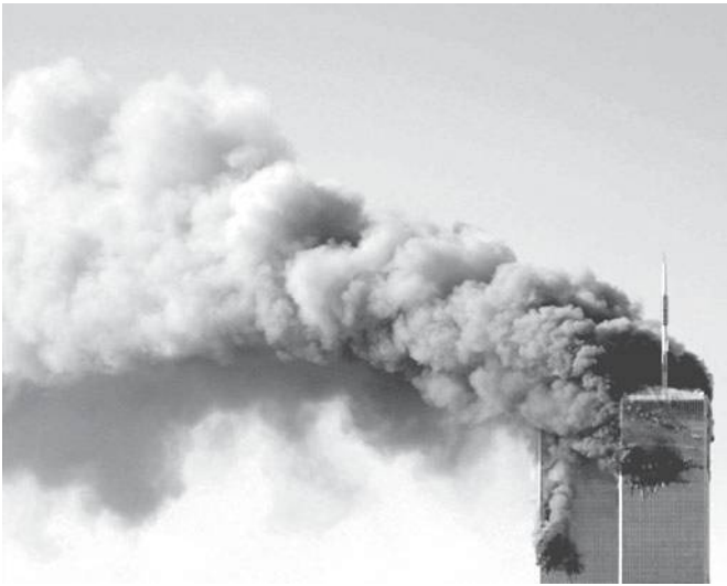
11. The twin towers of New York's World Trade Center on fire after being struck by airliners seized by Al Qaeda suicide hijackers on 11 September 2001.