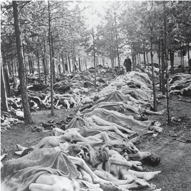
16. Victims of the Holocaust, the mass murder of Jews in continental Europe by the Nazis between 1940 and 1945. Six million died, the worst ever act of genocide.

The term genocide originated in the 20th century. Although the phenomenon occurred in previous centuries, the last century could truly be called the Age of Genocide and ‘ethnic cleansing’,