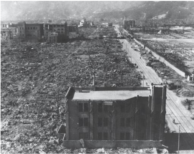
14. Hiroshima after the Allies dropped an atomic bomb on the city (6 August 1945). Three days later an atomic bomb was dropped on Nagasaki. Both cities were almost entirely destroyed and over 200,000 inhabitants were killed.

that nuclear weapons are described (that is, in the ‘kiloton’ or megaton range) is a measurement of the amount of TNT which would be required by a conventional weapon to approximate to the explosive force of a nuclear weapon, but this does not remotely capture the truly horrific nature of the effects of nuclear weapons. The evidence we have on the impact of nuclear bombs dropped on cities comes from the atom bomb attacks on the Japanese cities of Hiroshima and Nagasaki on 6 and 9 August 1945 respectively. It is important to note that these atomic bombs were very small compared to modern nuclear weapons in the megaton range. Bruce Roth in his powerful work No Time to Kill draws attention to the vivid observation by Carl Sagan: ‘Modern thermonuclear warheads use something like the Hiroshima bomb as a trigger – the “match” to light the fusion action.’