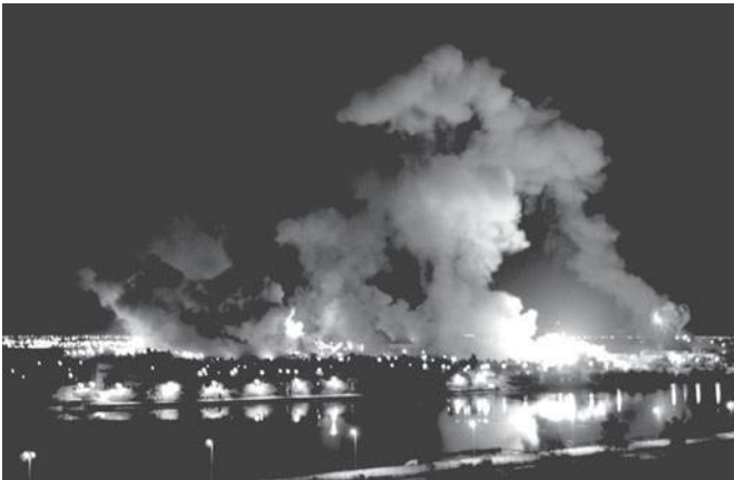
15. The bombing of Baghdad in March 2003 during Operation Shock and Awe.

foolishly cast aside by the US and UK governments in the lead up to the Iraq War in 2002–3. It is worth bearing in mind that if Dr Hans Blix had been given time to complete the rigorous weapons inspection he was leading in Iraq, the prolonged war in Iraq which has cost so many thousands of lives could have been avoided.